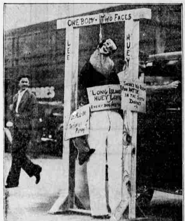
Political fever rose to high pitch in Hammond, La., during the election to select a successor to the late Congressman Bolivar Kemp. This effigy of Huey Long was burned on a Hammond street.