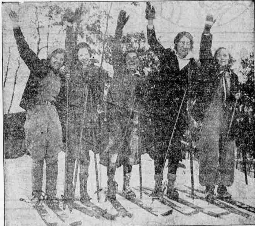
The snow storm that swirled over the east may have meant suffering for some, but not the unemployed girls and women at Camp Tera, Bear Mountain, New York. They took to their skis, and had a big time. Here a group waves gaily at a photographer. Camp Tera, organized for the care of jobless women, is sponsored by Mrs. Franklin D. Roosevelt.