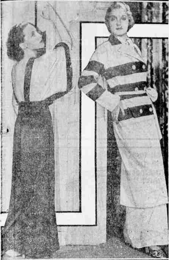
For the college girl who wants to be smartly dressed in lounging attire, here are the proper togs. The ensemble at right consists of clever pajamas and robe in white satin striped with wide bands of navy blue. Gail Patrick, film actress, wears the outfit. Dorothea Wieck at left wears a blouse of white satin with high-waisted trousers of black satin.