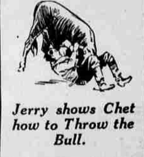
Jerry shows Chet how to Throw the Bull.

Seriously we are delighted to have Chet and Jerry with their high standard of service so near our Super Food Market, No. 2.