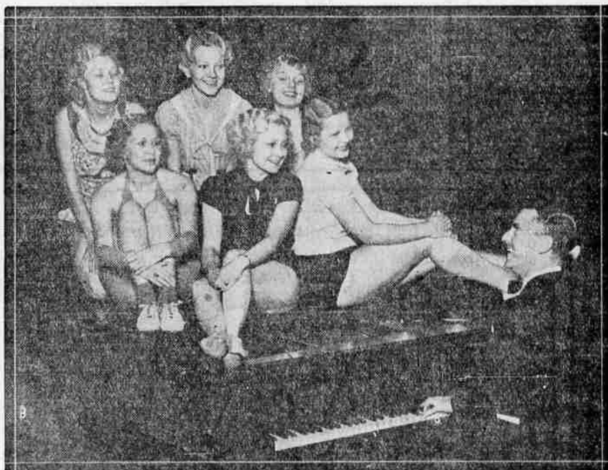
Here's George White, musical comedy impresario, and a piano-ful of beauties he selected to decorate the first of five annual editions of "Scandals" for a Hollywood motion picture studio. His first day's work involved picking 75 girls for the film edition of his Broadway show, but it appears he likes his work.