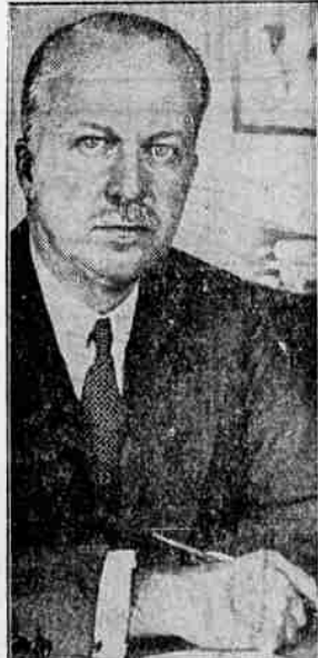
Walter S. Gifford (above), president of the American Telephone and Telegraph company, in a letter to Hugh S. Johnson, said his concern did not want to come under the NRA code because it is non-competitive in character. Johnson said he would impose a code containing labor provisions if necessary.