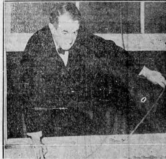
Senator Tom Connally of Texas, chairman of the committee investigating the election of Senator John H. Overton in Louisiana, is shown crawling through a window from the fire escapes into the women's washroom in order to get in to the committee hearing room in New Orleans. A huge crowd had blocked the front entrance to the building.