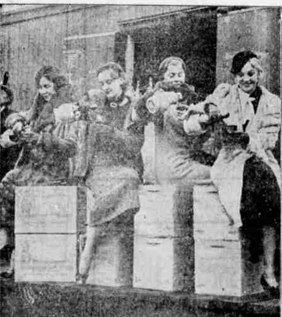
The first trainload of wine to cross the country in 14 years rolled out of the west and these beauties were on hand to meet it when it reached New York. They were rewarded with tasty sample from the train's cargo.