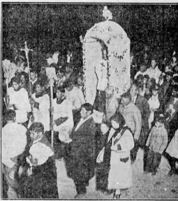
Blending pagan and Christian ceremonies, Papago Indians honored the memory of St. Francis Xavier near Tucson, Ariz., with a procession, feast and dancing. Part of the procession, with vested Indian altar boys preceding the catafalque bearing a statue of the saint as Franciscan monks and worshippers follow, is shown.