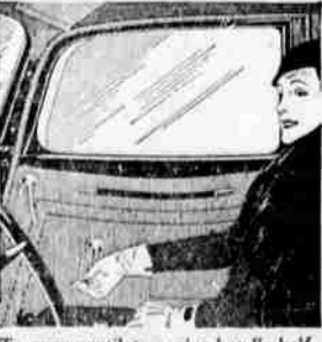
To open ventilators, give handle half-turn after window is raised to the top. Simple. Easy. Efficient.