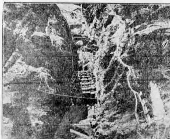
Here is the latest aerial view of the Boulder dam site on the Colorado river where progress ahead of schedule is being made. In this photo, looking downstream, the dam is seen rising in the river bed with Arizona (left) and Nevada spillways.