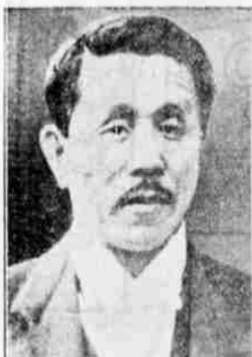
Koki Hirota is Japan's new foreign minister. In his first public pronouncement he said the outlook was hopeful for amity between Japan and her three great neighbors, the United States, China and Russia.