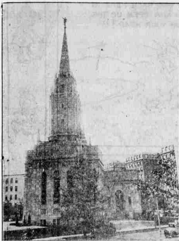
At dedicatory ceremonies on Nov. 5, this half million dollar chapel in Washington, D. C., will be consecrated by the Latter Day Saints church. Members of the first presidency and other officials of the faith were to attend.