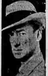
Portrait of a man in a suit

COMPETITION for jobs is becoming more than ever before in the life-