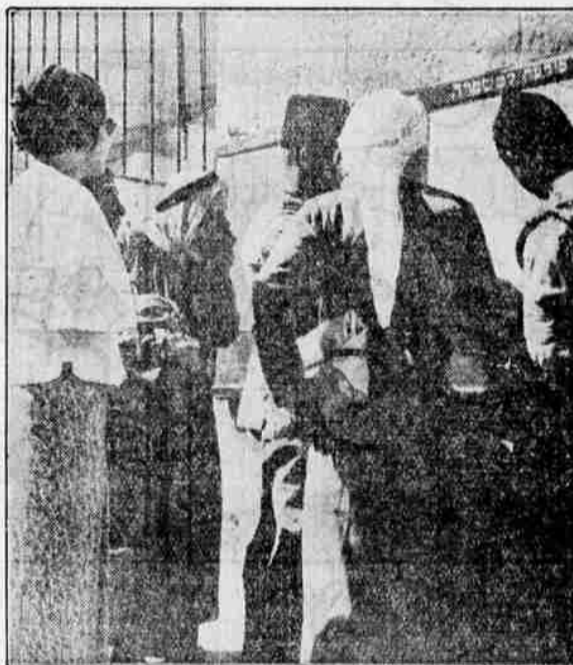
With 30 persons killed and 200 wounded in demonstrations against migration of German Jews to the Holy Land the situation among the Arabs continued tense. Arabs and tourists in Jerusalem are reading a poster forbidding a procession to the Mosque of Omar to protest against further immigration of Jews.