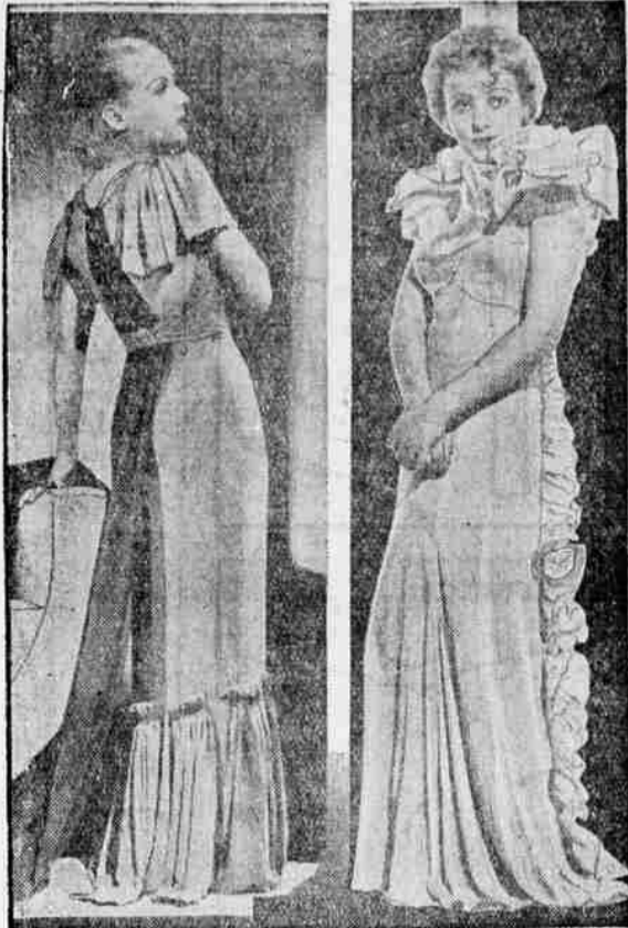
An evening gown of gold toned crepe with ties of tomato crepe that fall from the décolletage at the back into a graceful train is worn by the screen actress, Carol Lombard (left). Chiffon and organdie are successfully combined in a green evening frock worn by Ida Lupino (right), film player.