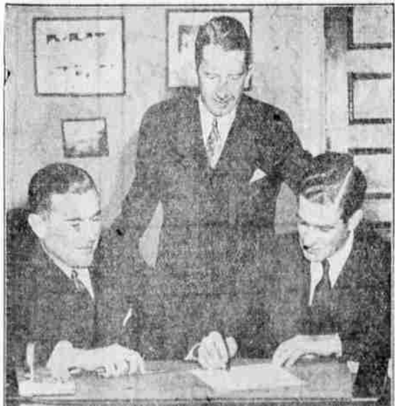
With the remark "If I can't get results in a year, then somebody else deserves the chance," Stanley "Bucky" Harris (right) signed a contract as manager of the Boston Red Sox for next year. Watching are President Tom Yawkey (left) of the Boston club, and General Manager Eddie Collins. Harris, who managed the Detroit Tigers last season, succeeds Marty McManus.