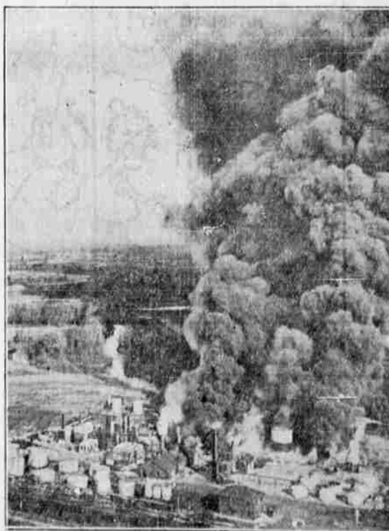
One man was killed and two others injured in this spectacular oil fire at Mount Pleasant, Mich. The flames spread to 12 storage tanks, and damage was estimated in excess of $150,000.