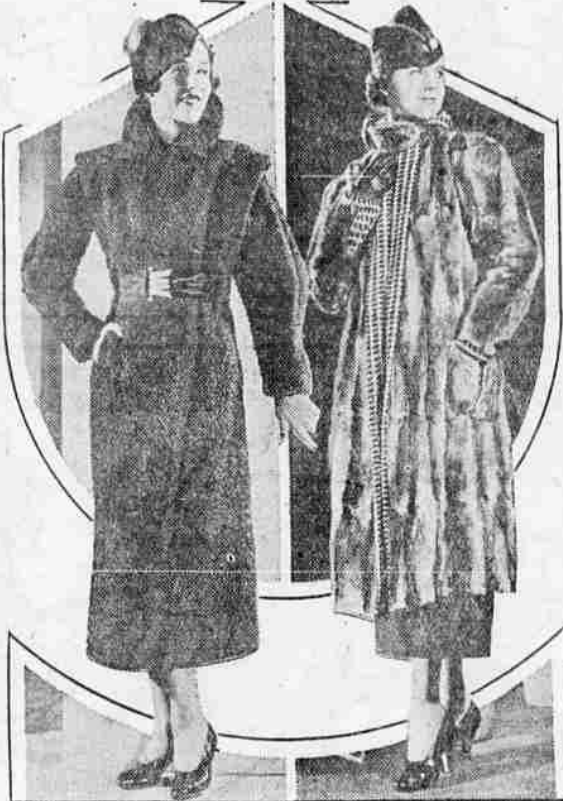
Here are two fur coat designs which probably will find favor on the campus. At left is a muskrat swaggar model. A coat of Persian lamb is shown at right. It is belted with black antelope and buckled with a novelty metal design.