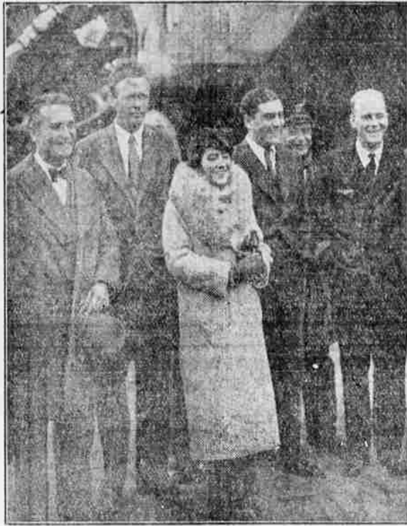
Col. and Mrs. Charles A. Lindbergh photographed with a group of French airmen at Le Bourget field near Paris, after visiting the spot where Lindbergh ended his Atlantic ocean flight in 1927.