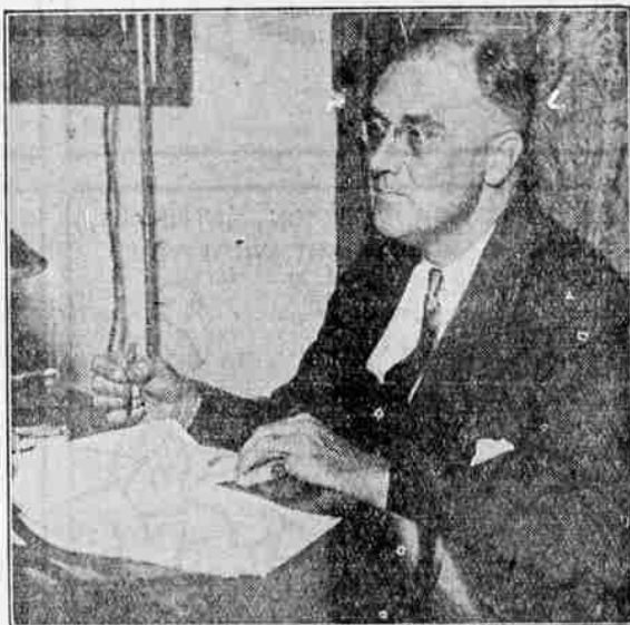
President Roosevelt is shown at his desk in the White House when he addressed the nation on his recovery program. Besides announcing a new policy to control the dollar, the President answered critics of the NRA.