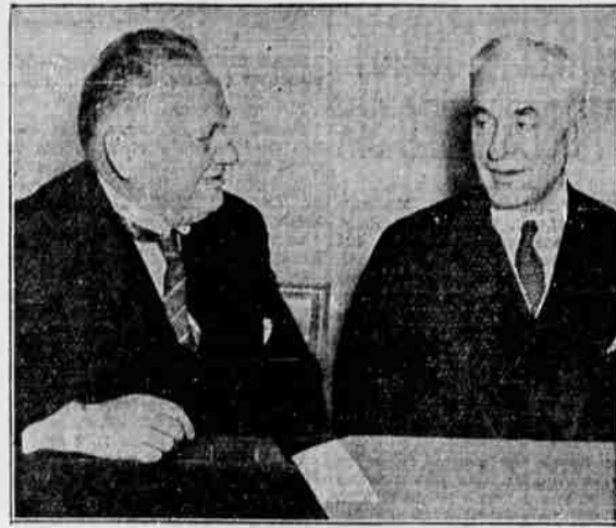
Maxim Litvinoff (left), Soviet commissar for foreign affairs, is shown during a preliminary conference with Secretary of State Cordell Hull in the consideration of United States recognition of Russia.

posed well up the side of the pan, and, if you wish, cover the top with oiled paper until the cake is nearly finished to protect the fruit on the surface from over-cooking. Bake three hours in a slow oven (275 degrees).