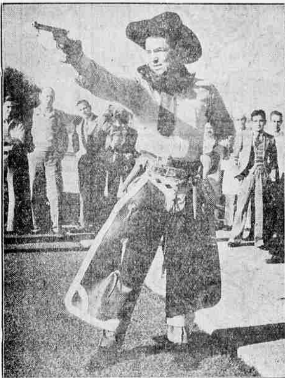
Jack Dempsey, former champion heavyweight, put on full western regalia, including a 10-gallon hat, and led with a six gun instead of a left during a visit to Tucson, Ariz. Here's the old mauler in the old western outpost.