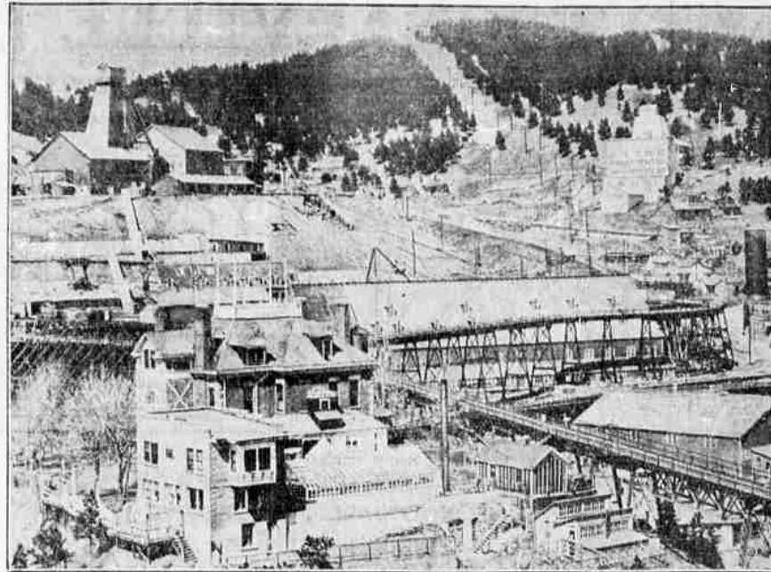
The government's policy of buying gold at a fixed price has focused attention again on the nation's more famous gold mines. This is a general view of the noted Homestake mine at Lead, S. D., which produces about $6,000,000 in gold annually. Since 1876 this mine has produced more than $200,000,000 in gold.