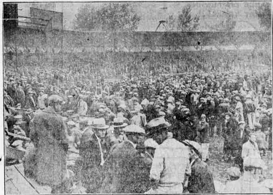
When thousands of members of the Progressive miners' union marched into Springfield, Ill., to protest against conditions in Illinois soft coal fields, they congregated in Springfield's baseball park.