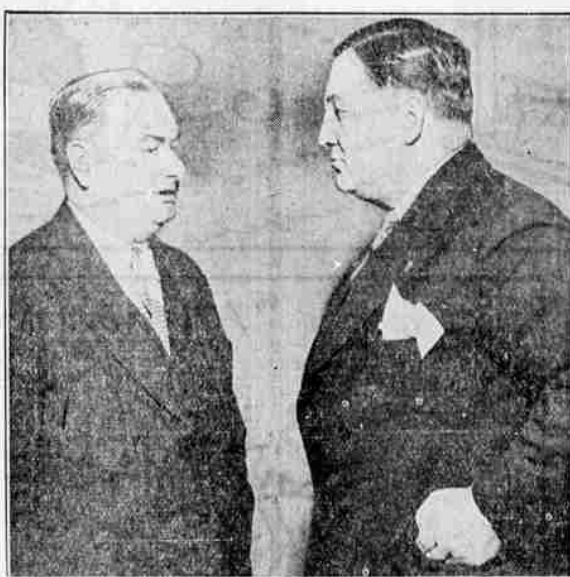
Joseph B. Keenan (left), special assistant attorney general in charge of the federal drive on gangs and racketeers, is shown discussing with Judge Thomas O. Green of Chicago some of the problems the senate sub-committee hearing in Chicago is investigating.