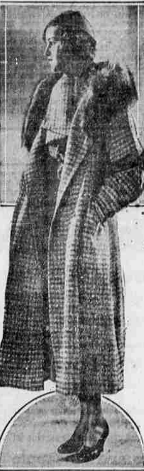
The co-ed can go anywhere in this smart checkered brown and beige tweed top coat. It has a collar of raccoon with an inner scarf permitting it to drape the shoulders in pleasant weather.