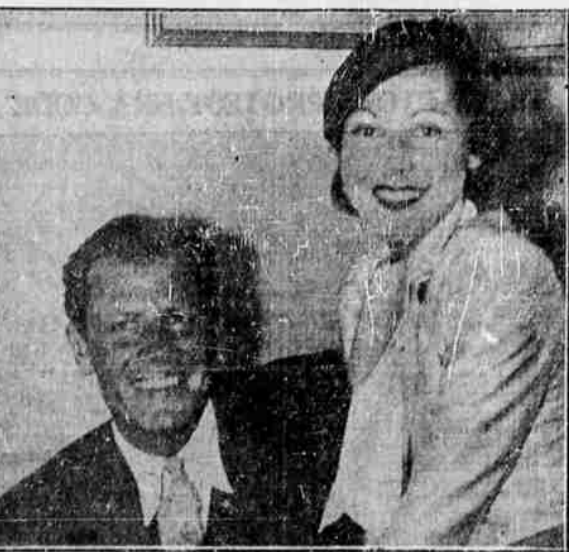
Joel McCrea and Frances Dee of the films "Just slipped away by themselves" and were married in Rye, N. Y., and planned to spend a honeymoon in New York and Connecticut.