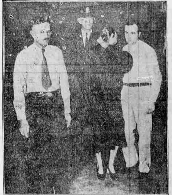
Mrs. George "Machine Gun" Kelly ducked and hid her head as she walked out of the police show-up at Memphis, where she was captured with her notorious husband.