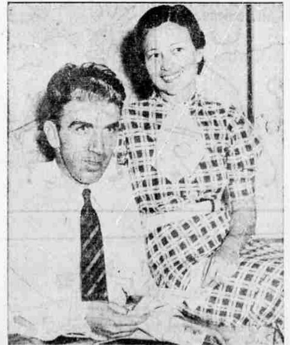
Carl Hubbell, star hurler of the New York Giants, National League pennant winners, and his wife are looking over messages of congratulations which poured into their New York apartment. Hubbell is a native of Mosier, O.K.