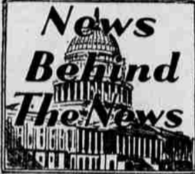
By PAUL MALLON (Continued from Page One)

played out as a stimulating economic factor, a treasury official tells this story: