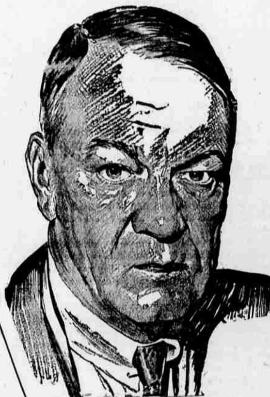
GENERAL HUGH JOHNSON National Recovery Administrator