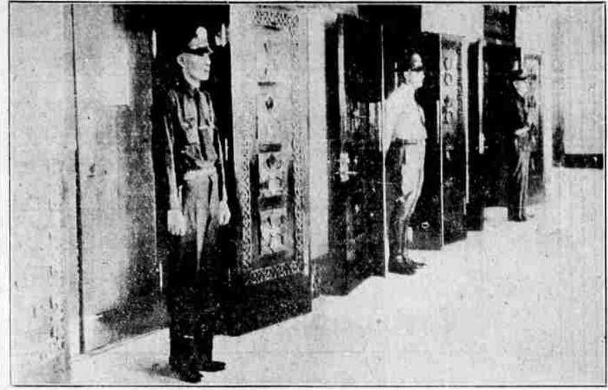
Heavily armed guards stand at the doors and in the corridors and stairways of the federal building in Oklahoma City during the trial of 12 defendants for the kidnaping of Charles F. Urschel.