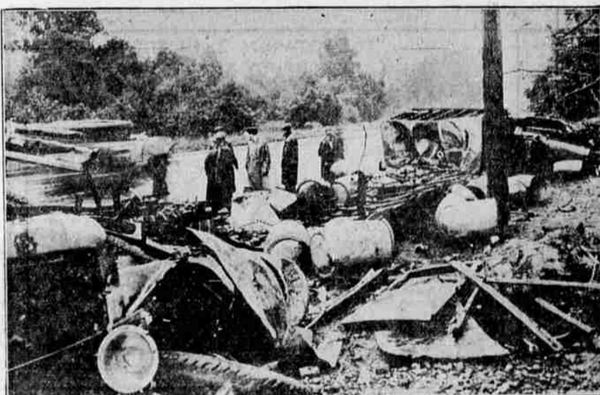
This picture shows the remains of two trucks, one of which was loaded with picnickers and the other with chemicals, after they crashed near Wilmington, Del., killing four persons and injuring 22 others. Fire and an explosion of the chemicals followed the accident.