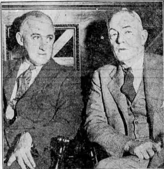
Steps necessary to stamp out organized crime were discussed at the hearing of the senate sub-committee on racketeering in New York. Among the many notable speakers were Raymond Moley (left), assistant secretary of state who was lent to the department of justice to survey the racket situation, and Edward P. Mulrooney, former New York police commissioner.