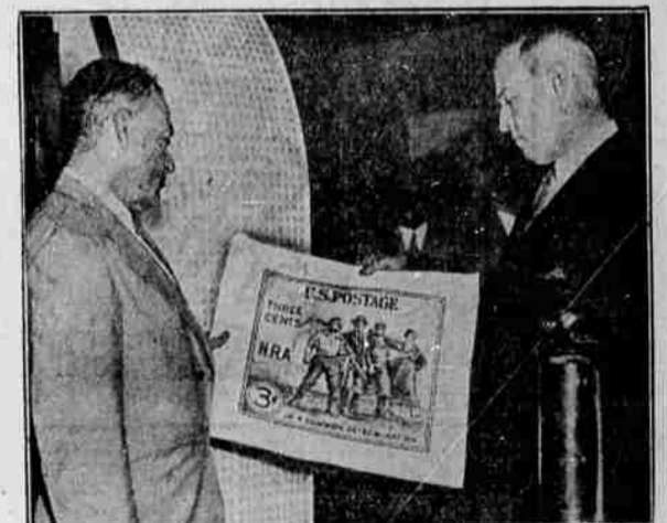
Hugh S. Johnson (left) and Postmaster General James A. Farley inspect the original drawing of Uncle Sam's new three-cent NRA stamp, 400,000,000 of which are being printed to publicize the national recovery administration.