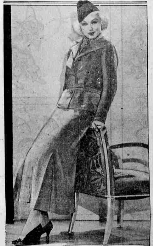
Fall fashions favor knitted suits for sport wear. Toby Wing, film player, selects a norfolk type suit in grey knit wear with a brown knit cap and brown and white striped scarf.