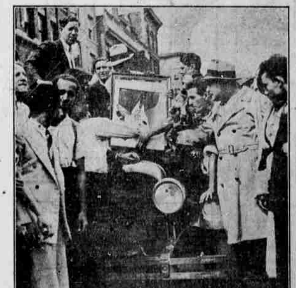
Members of a secret Cuban revolutionary society raided the Cuban consulate in New York, assaulted the acting consul general and carried off a bust of Gerardo Machado. The bust was made a target for mud and soft fruit. The Cubans also had framed portraits of the former Cuban president which were torn to bits. Above picture shows the end of a Machado portrait.