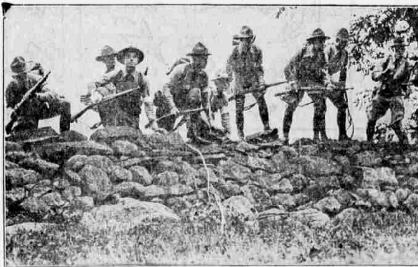
A detachment of future army officers is shown going "over the top" during a raid on an imaginary enemy as part of West Point's summer field exercises. For five days the entire cadet corps drilled under near-war conditions.