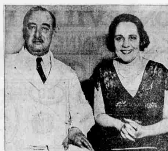
Col. Orestes Ferrara, secretary of state of Cuba under the Machado regime, is shown with Senora Ferrara as they arrived in Miami after fleeing from Cuba to become exiles in the United States. Ferrara, often had been called Cuba's savior because of his long career in the island republic.