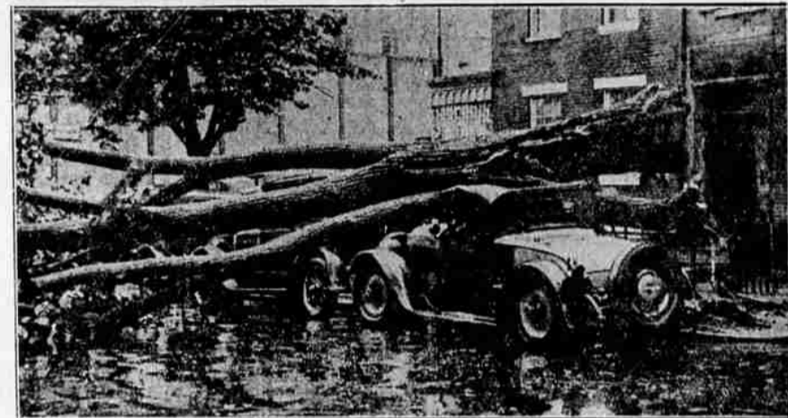
These two pictures provide some idea of the extensive property damage caused by severe storms along the Atlantic seaboard. Above is a scene at Elizabeth, N. J., taken at the height of the storm there, and the picture below shows how a large tree fell on a parked automobile in Washington, D. C.