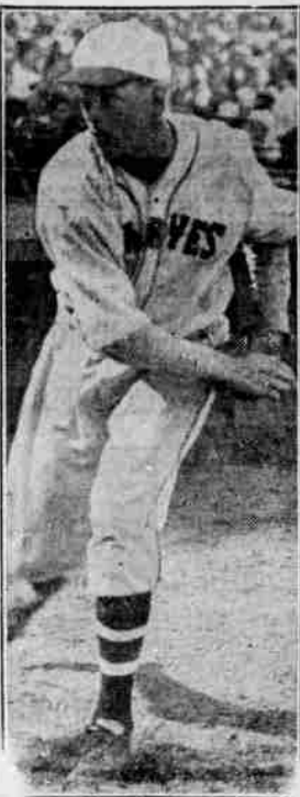
Sen Cantwell, star pitcher, is one of the reasons for the climb of the Boston Braves to challenging position in the National league race.