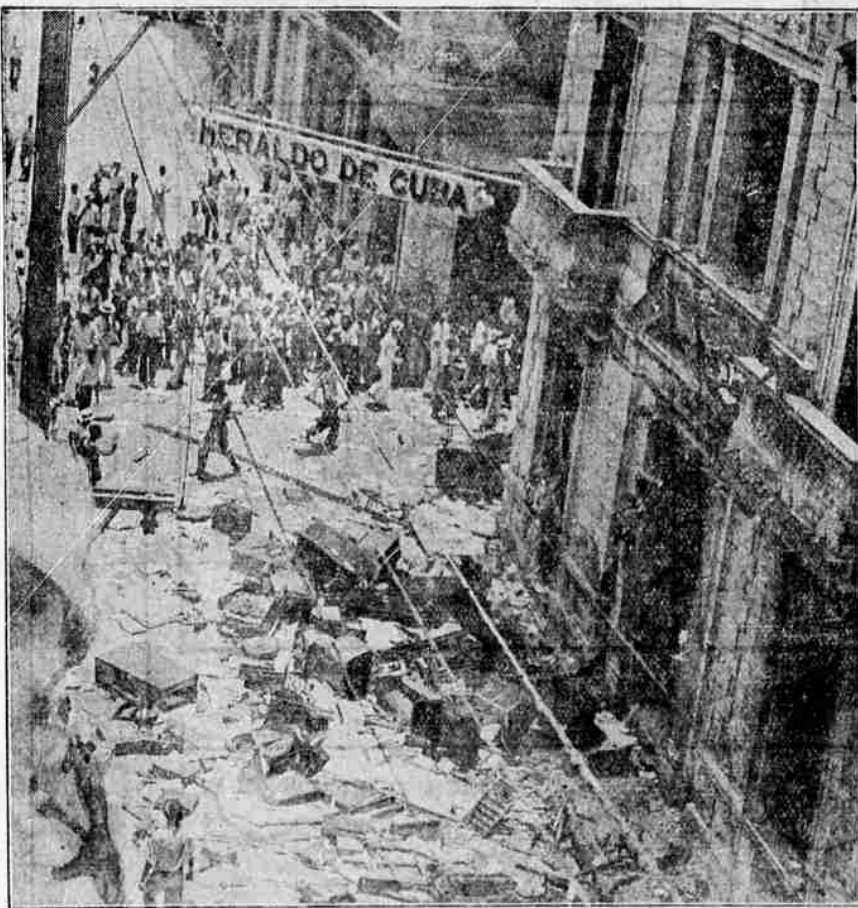
This Associated Press picture shows a mob of Cubans in front of the Havana newspaper Herald de Cuba, unofficial organ of the Machado government, after they had attacked the property and destroyed much of the paper's equipment. This scene was taken during the wild disorders which occurred during Machado's overthrow.