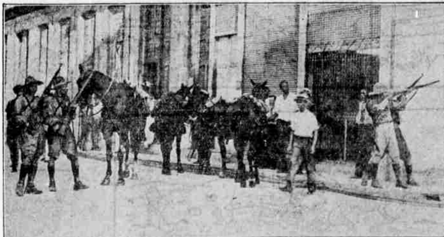
Such scenes as this were common in Havana when Cuban soldiers rounded up and shot or imprisoned members of former President Gerardo Machado's strong-arm squad, the Porricias, who were charged with slaying political opponents in attempts to maintain the Machado dictatorship by force.