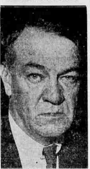
Here is a recent picture of Gen. Hugh S. Johnson, national recovery administrator.

BUY NOW! IS PLEA TO SPUR RECOVERY UNDER NRA BANNER