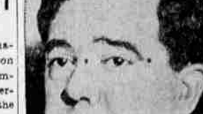
HUEY LONG of Louisiana, in his stocking feet, has a local reputation as a skilled boxer and trainer of amateur boxers.