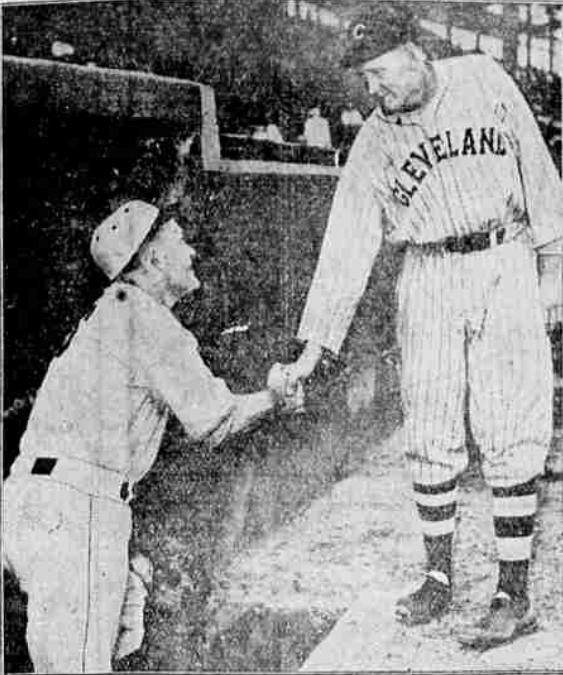
Walter Johnson (right), manager of the Cleveland Indians, was the newest pilot in the American league until Rogers Hornsby became manager of the St. Louis Browns. The "Big Train" is shown wishing luck to the "Rajah."