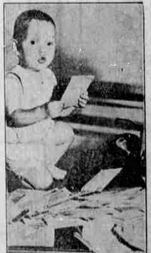
Baby Leroy, one of the Hollywood ultra-younger set, is about to get busy on that typewriter to answer his mounting stack of fan mail.