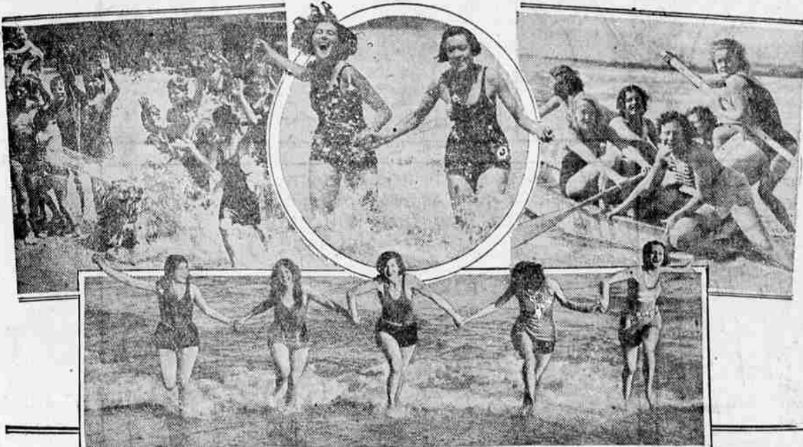
The kids in Chicago (upper left) and the pretty girls in Venice, Cal., (upper right) are showing you the perfect remedy for August's sizzling heat. Beaches and pools through the country are crowded as millions flee sunbaked city streets to splash in the cool water.