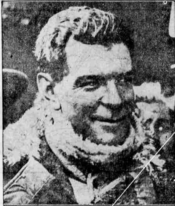
The wheels of the plane in which the Australian aviator, Capt. Charles T. P. Ulm and three companions planned to fly to North America, sank in the sands at an airfield near Dublin, Ireland, resulting in injuries to five persons. The plane was damaged, delaying the take-off several days. Ulm, shown above, was not hurt.