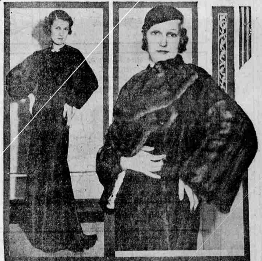
The sleeves come off of the gown shown at left to make it an evening dress. It is in the prevailing black satin which stylists say will be popular this fall. At the right is a swagger model of natural mink, with a flaring tie and wide bell sleeves. These fashions were displayed at the western market week show in San Francisco. (Associated Press Photos)