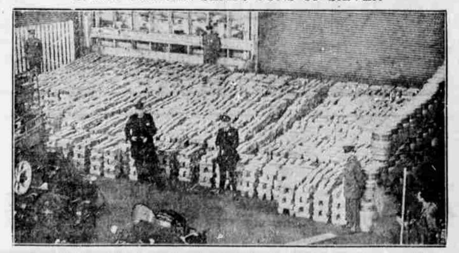
These 9000 hars of silver from India, worth $5,000,000, were placed in the San Francisco mint upon arrival. The metal represents part of the payment due from Great Britain on war debts. Each bar weight between 73 to 75 pounds.