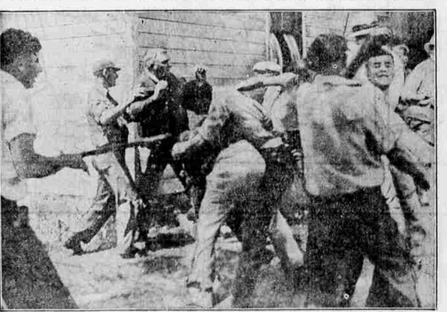
This unusual action scene was taken near Rochester, N. Y., as a crowd of striking milk producers were attempting to disarm guards protecting milk trucks. The strikers, using clubs and pitchforks, dumped the milk. This section also was the scene of clashes between strikers and state troopers.