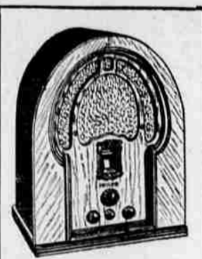
The sensation of the radio world is this convenient size table PHILCO with super-heterodyne with electro-dynamic speaker.

THE famous Philco line is now featured at "your favorite electric store," offering the people of southern Oregon the widely heralded "X" models which provide the ultimate in radio design and performance—the very highest development in scientific sound reproduction—at prices for every purse. You will find in this PHILCO showing radios—