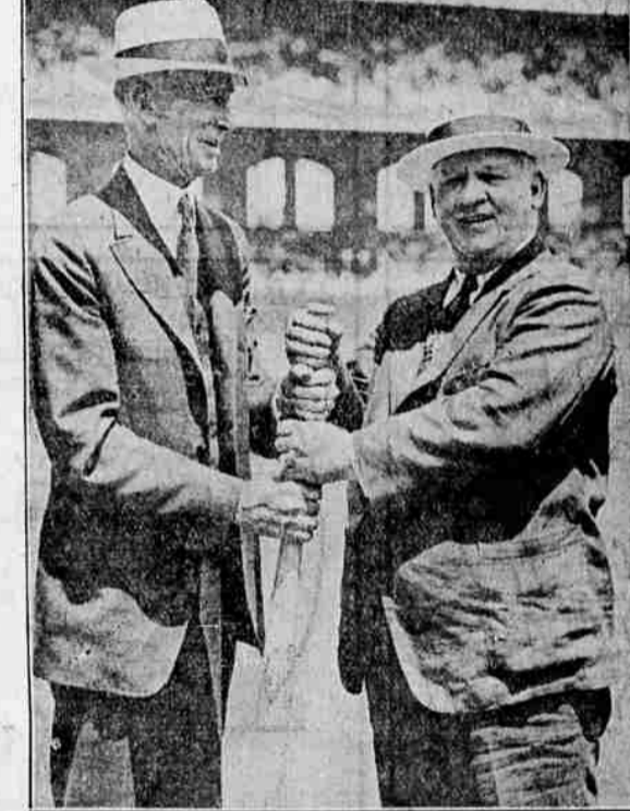
When Connie Mack (left) and John McGraw met as managers of the all-star American and National league teams, respectively, in the big game at Chicago they re-enacted roles they occupied exactly 20 years before when as pilots of the Philadelphia Athletics and New York Giants, they last faced each other in a world series. In the 1913 series Mack's team won, four games to one.