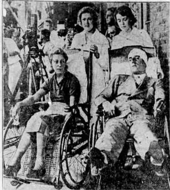
Starting the last and most painful lap of their Belfast to New York air venture, Capt. and Mrs. J. A. Mollison are shown leaving a Bridgeport, Conn., hospital in wheel chairs for an ambulance-plane ride to Floyd Bennett field. They were hurt in a landing crack-up at Stratford, Conn.