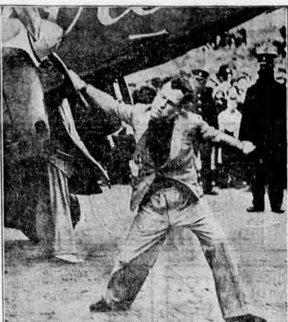
Capt. James A. Mollison, who with his wife, Amy Johnson, plans a round-trip flight over the Atlantic, is shown turning over one of the motors of his plane, the Seafarer, for a test flight at Carnarthen, Wales.