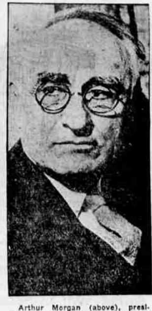
Arthur Morgan (above), president of Antioch college in Ohio, was named by President Roosevelt as chairman of the Tennessee valley authority. Achievement of the new Muscle Shoals program will be part of his work.