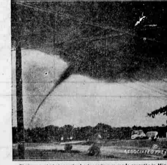
This unusual photograph of a tornado was made recently in Minnesota when it cut a thin swath through the towns of Friberg and Aurdal. Two persons were injured by the twister which leveled buildings on four farms. This picture was made at Fergus Falls, nine miles from the center of the storm.