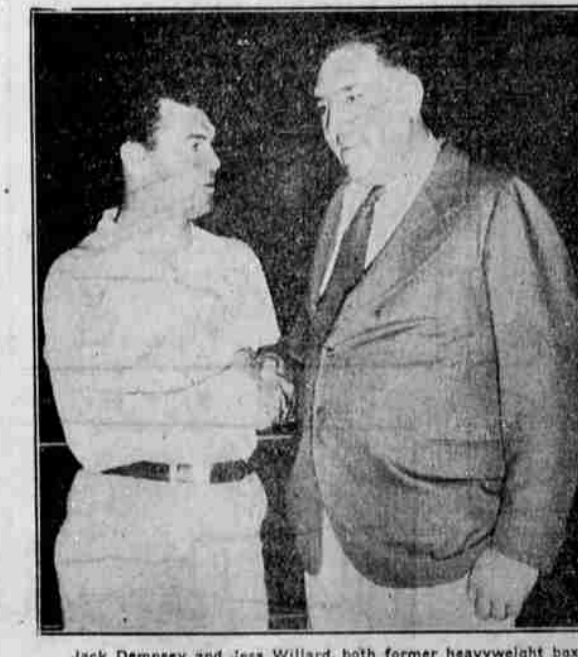
Jack Dempsey and Jess Willard, both former heavyweight boxing champions, shook hands for the first time since July 4, 1919, in Los Angeles. Dempsey knocked out Willard 14 years ago and they had not climbed into a ring together again until their meeting in Southern California.