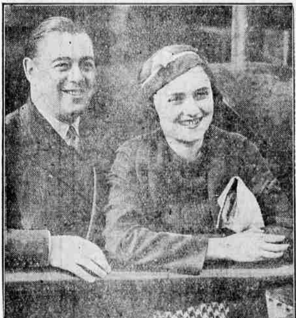
Morton Downey, singer, and his wife, Barbara Bennett, actress, returned to New York recently from a vacation in Europe.