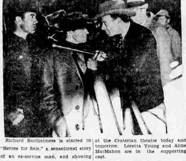
Richard Barthelmess is starred in "Heroes for Sale," a sensational story of an ex-service man, and showing cast.