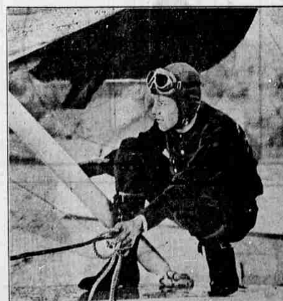
Col. Charles A. Lindbergh is shown perched on a pontoon of his big red and black monoplane as he tied up the craft at the Royal Canadian Air Force base at Halifax, N. S., a stop on the Greenland flight he is making with Mrs. Lindbergh.