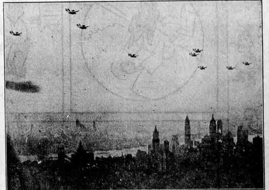
New Yorkers were given a good look at the Italian flying squadron of 24 seaplanes as they soared over lower Manhattan before coming to rest at Floyd Bennett field. They are headed for Italy after visiting the Chicago world's fair.