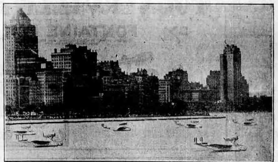
Far from their home base at Lake Orbetello, Italy, some of the 24 giant seaplanes of the Italian armada are shown riding at anchor in Lake Michigan off Chicago's gold coast.