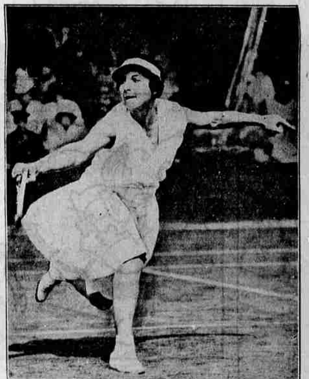
This striking action picture shows Helen Wills Moody, world's reigning tennis queen, executing a difficult shot with the flawless form for which she is noted, during play at Wimbledon, England.