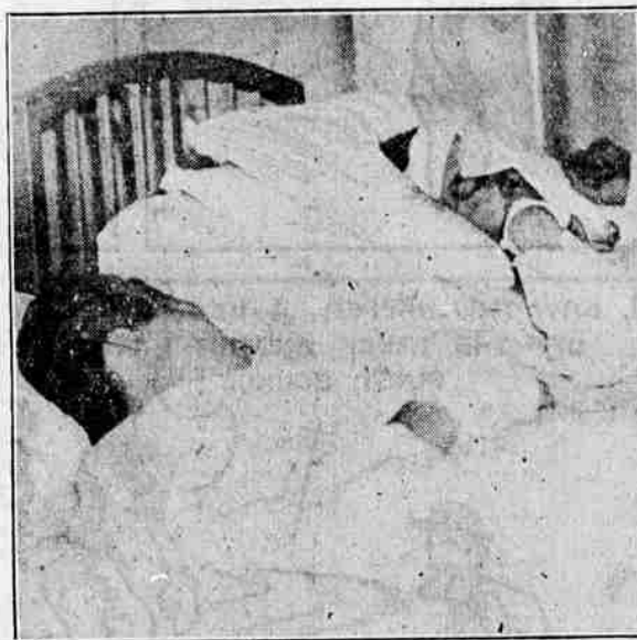
Capt. James A. Mollison and his wife are shown as they rested in a hospital at Bridgeport, Conn., and recovered from bruises caused when their plane was wrecked in a forced landing after their flight across the Atlantic from Wales.