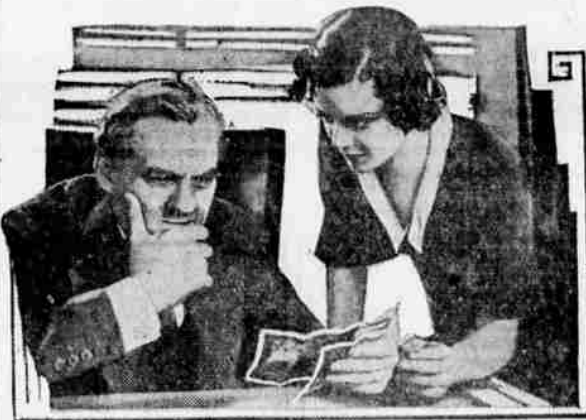
Lionel Barrymore, as the empire builder in "Sweepings," finds that one of his sons has been "playing around" with the employees of the store and is being blackmailed by Helen Mack. The picture opened a three day run at the Rialto theatre today.