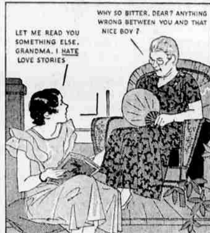
LET ME READ YOU SOMETHING ELSE, GRANDMA. I HATE LOVE STORIES