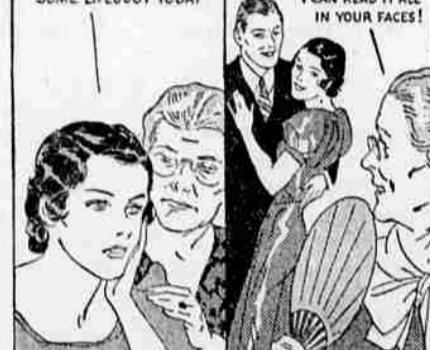
...AND GRANDMA, HE MAY HAVE NOTICED "B.O." OTHER TIMES, TOO! HOW TERRIBLE! I MUST GET SOME LIFEBOUY TODAY