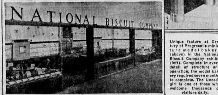
Unique feature at Century of Progress is miniature model bakery (above) in the National Biscuit Company exhibit (left). Complete in every detail of structure and operation, the model bakery required seven months to complete. The Uneseda girl is one of those who welcome thousands of visitors daily.