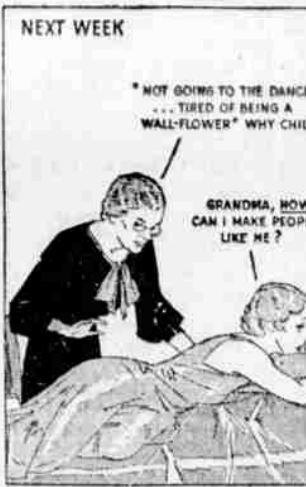
TRY IT ANOTHER WEEK FOR GRANDMA'S SAKE. THINGS MAY LIVEN UP.