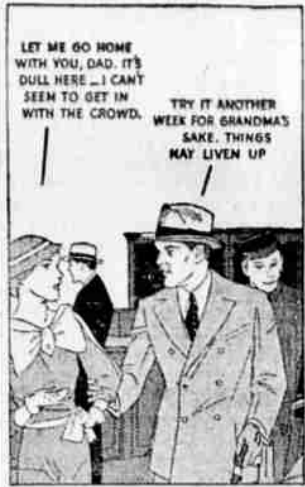
LET ME GO HOME WITH YOU, DAD. IT'S DULL HERE. I CAN'T SEEM TO GET IN WITH THE CROWD.