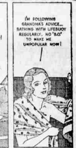
IF FOLLOWING GRANDMA'S ADVICE... BATHING WITH LIFEBOUY REGULARLY... NO 'B.O.' TO MAKE ME UNPOPULAR NOW!