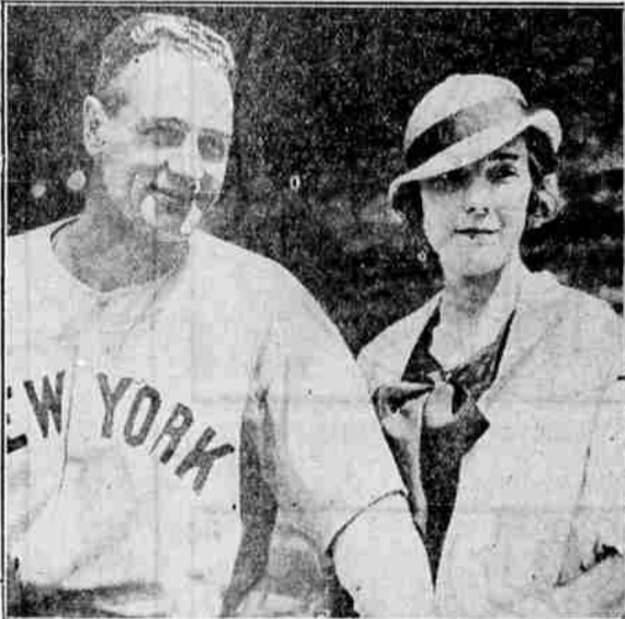
Lou Gehrig, home run-hitting first baseman of the New York Yankees, finally ended a long non-committal silence by admitting his engagement to Miss Eleanor Twitchell of Chicago.