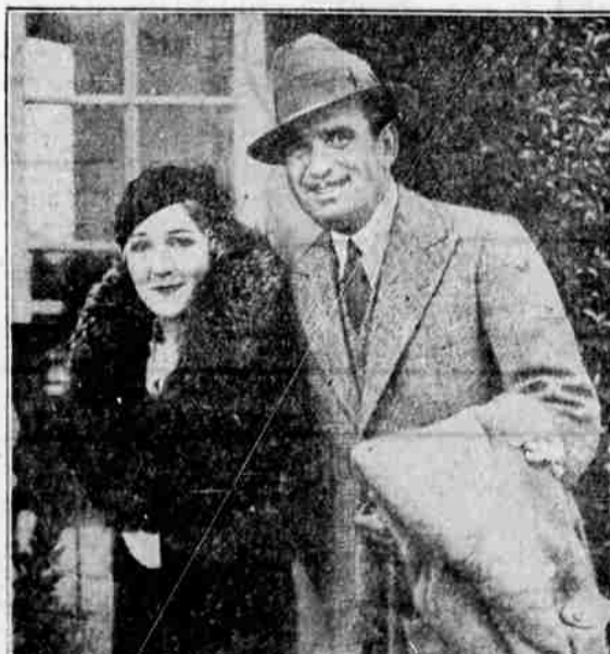
A contemplated separation, possibly divorce, of Mary Pickford and Douglas Fairbanks, famous film couple, was disclosed when "America's sweetheart" herself announced that Pickfair, their palatial Hollywood home, is for sale.