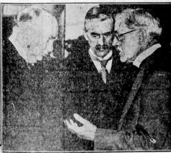
It was no laughing matter when these statesmen of the British empire discussed world problems at the London conference. Left to right: Premier Bennett of Canada, Neville Chamberlain, chancellor of the exchequer, and Prime Minister Ramsay MacDonald.