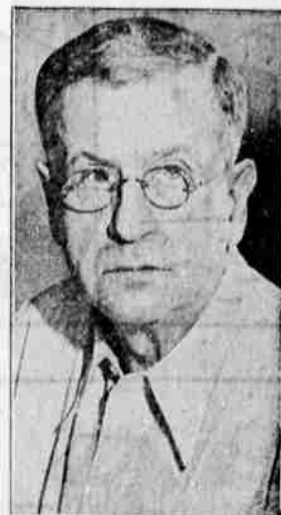
When other government employees went home on one of the hottest Saturday afternoons of the year Harold L. Ickes, secretary of the interior, shed coat and tie to dive into work on industrial recovery, public works projects and routine problems.