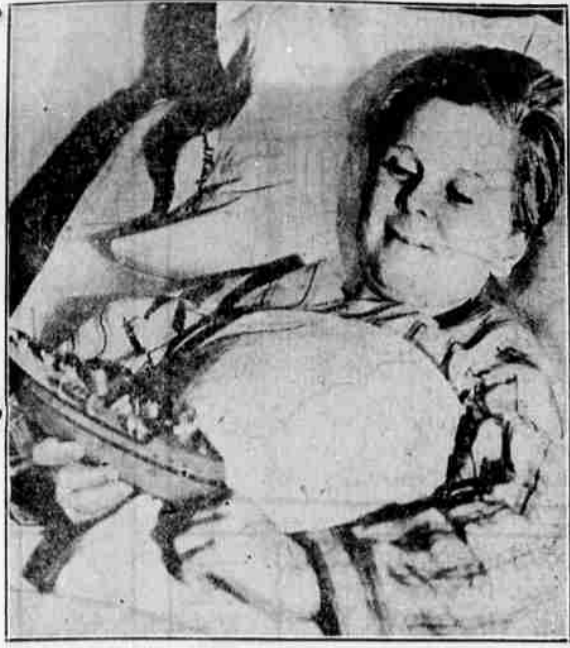
Jackie Cooper's room in a Hollywood hospital was filled with toys of all descriptions while the youthful film player recovered from an appendicitis operation. Here Jackie is inspecting a toy boat.