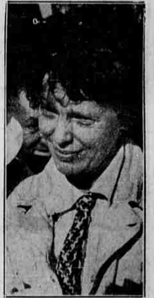
Amelia Earhart, trans-Atlantic woman flier, as she arrived in Los Angeles to attend the national air races after a cross-country flight. She failed to place in the transcontinental dash.