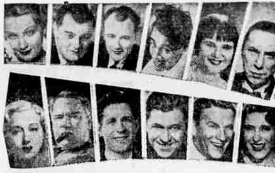
"International House" at the Craterian theatre for three days starting today, might well be called the "Grand Hotel" of musical comedy. There certainly are enough stars.