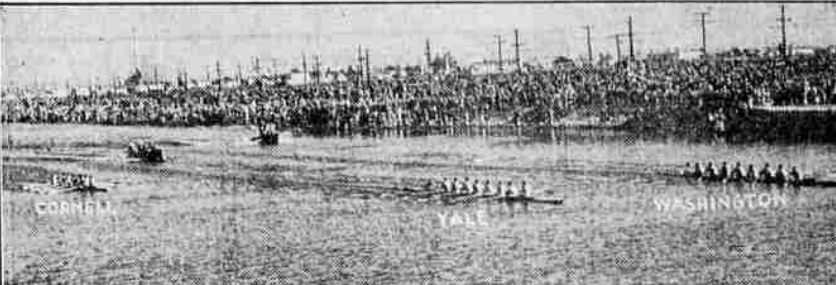
Washington beat out Yale for the national rowing title by six feet in a thrilling sprint on the Olympic course at Long Beach in the national intercollegiate championships. Cornell placed third.