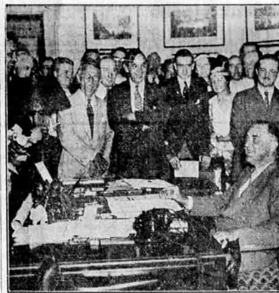
Back from his two weeks' vacation cruise, President Roosevelt greeted representatives of the press soon after he returned to his desk.