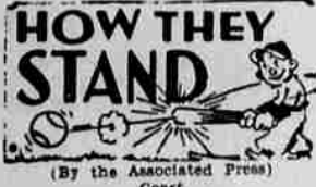
HOW THEY STAND (By the Associated Press)

Score by innings: National 0 0 0 0 2 0 0 0—2 8 0 Americans 0 1 2 0 0 1 0 0—4 9 1 Hallahan, Warneke, Hubbell and Hartnett; Gomez, Crowder, Grove and Dickey.