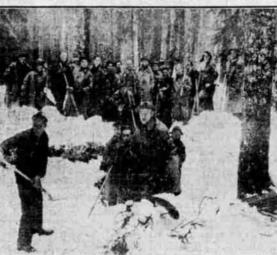
Members of the civilian conservation corps, recruited from New York, found four feet of snow on their campsite at Narada Falls on Mt. Rainier. Here they are digging out the snow for their tent foundations in the Washington state camp after arrival from the east.