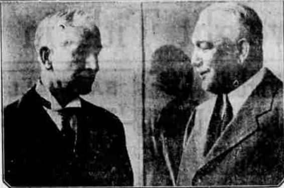
Secretary Hull, it seems, is a busy man for here he appears again, this time exchanging views with Germany's representative, Baron von Neurath.

Phone 542. We'll haul away your refuse. City Sanitary Service.