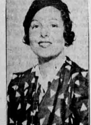
Norma Talmadge's marital plans continued to puzzle Hollywood friends as the actress returned to the west coast and said that she might institute divorce proceedings against Joseph Schenck, wealthy film producer, in California.