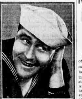
Jack Oakie is a rollicking battler-pugilist with a weakness for good looking blondes in "Sailor Be Good."

deep, measured sound of the bass tones, a big step forward for the sound picture.