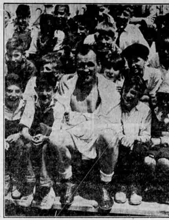
Jack Sharkey stepped out of the ring for a rest after a fast workout with his sparring partners at Orangeburg, N. Y., and was immediately surrounded by a group of his young friends. He is working down to the close of the training grind for his 15-round title defense against Primo Carnera in New York, June 29.