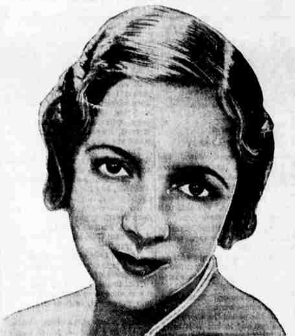
Helen Hayes is co-starred with Clark Gable in "The White Sister," and opening a four-day engagement at the Craterian theatre today.