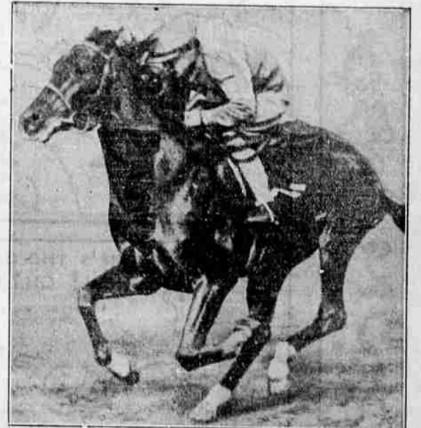
Lord Derby's Hyperion won the 150th running of the English Derby at Epsom Downs before a crowd of 250,000. The winning horse is shown with Jockey Tommy Weston up.