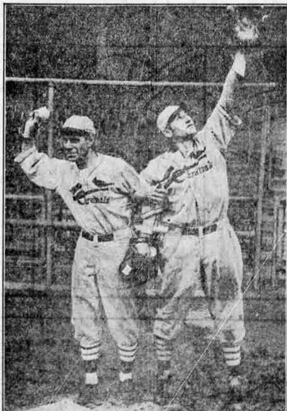
It's quite a job to get anything by these two boys. At the left is Leo Durocher, former Yankee, who has taken over the shortstop assignment with the St. Louis Cardinals following a sensational trade with the Cincinnati Reds. At right is Pepper Martin, former series hero, whose work at third has proven a revelation.