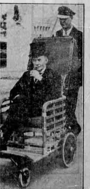
Gen. Charles Gates Dawes elected to view the Chicago world's fair from this type of wheel chair, used to escort visitors through miles of exhibits.