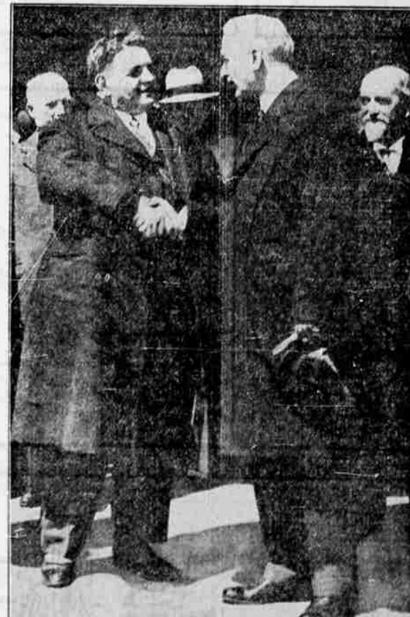
Eduard Herriot (left), former premier of France and that nation's spokesman in the economic conferences with President Roosevelt, is shown as he was welcomed in Washington by Secretary Hull of the state department.