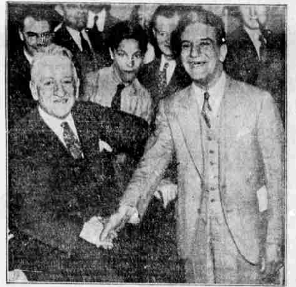
Senator Carter Glass (left) of Virginia and Ferdinand Pecora shook hands after Pecora had complied with Glass' demand to say definitely what he expected to bring out in the senate banking committee's investigation of the J. P. Morgan banking house.