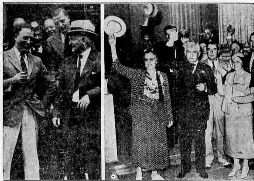
Smiles flashed across the faces of weary congressmen as the gavel fell on the busiest peace time session in history. At left Vice President Garner is shown talking to newspapermen just before congress adjourned. Picture at right shows how Speaker Rainey (second from left) and his colleagues in the house greeted news of adjournment.