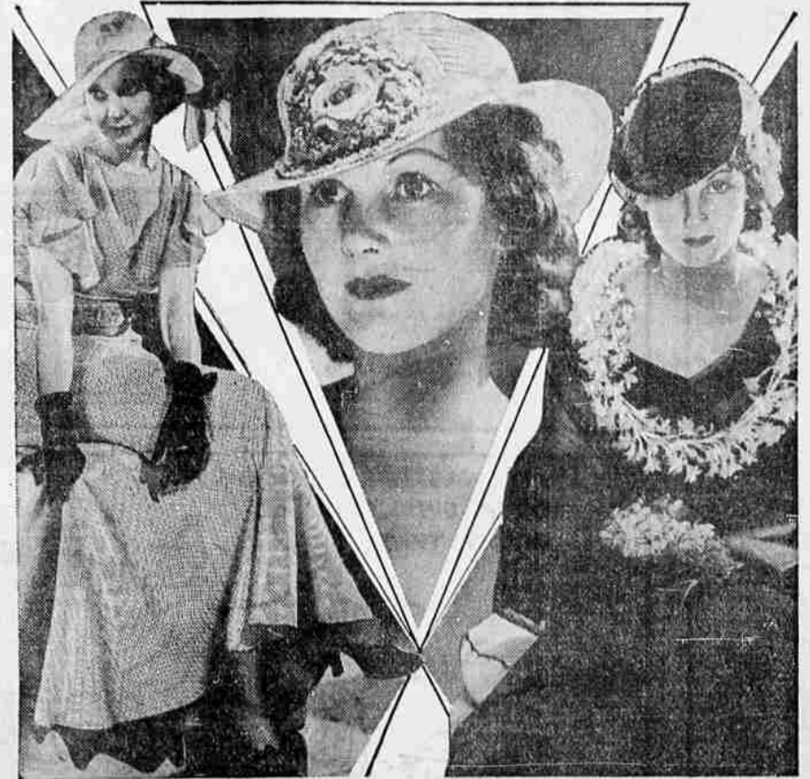
The fashion experts say these costumes will be smart for summer. At the left Una Merkel of the films wears an afternoon frock with a tiny blue check against a white background, with blue net gloves and open-work design on the pumps to carry out the checked effect. A wide brimmed hat with a rosette of beige lace at the front is worn by Elizabeth Allan (center), and at the right she is shown in a dinner costume, with hat of black crystal straw with white hyacinths banked across the back. Her gown is of black chiffon.