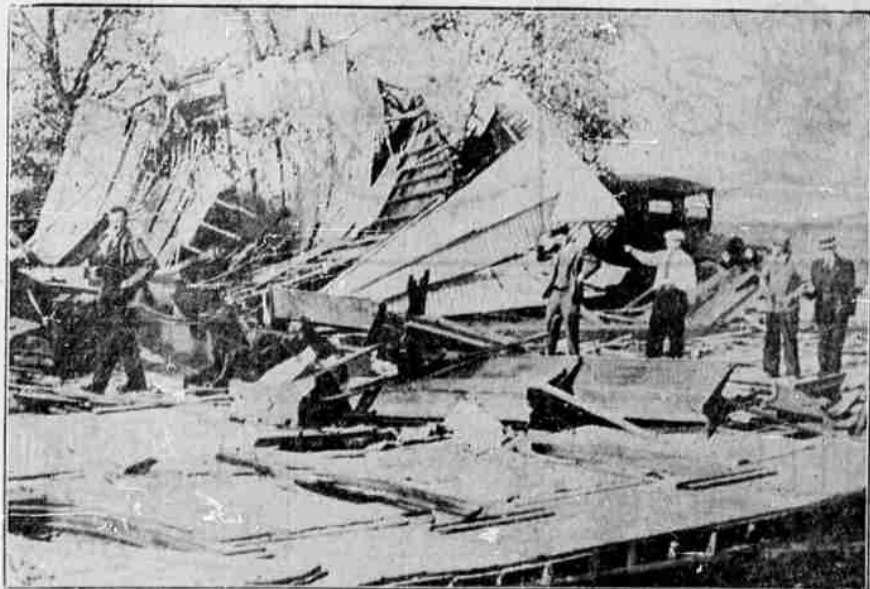
This picture shows the ruins of the Baptist church at Lake Lillian, Minn., after a tornado swept the town and injured more than a score of persons in addition to causing widespread property damage.