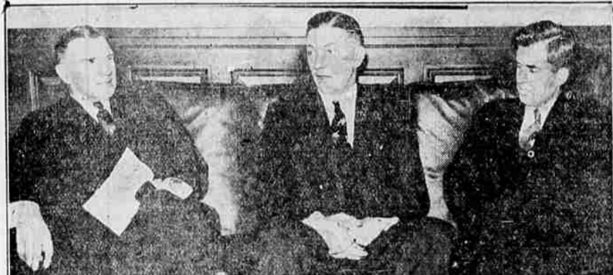
Three midwesterners who are leaders in new movements for farm relief are shown discussing plans in Washington. Left to right: George N. Peek of Moline, Ill., administrator-designate of the new farm bill; Gov. Floyd B. Olson of Minnesota, and Secretary of Agriculture Henry Wallace of Iowa.