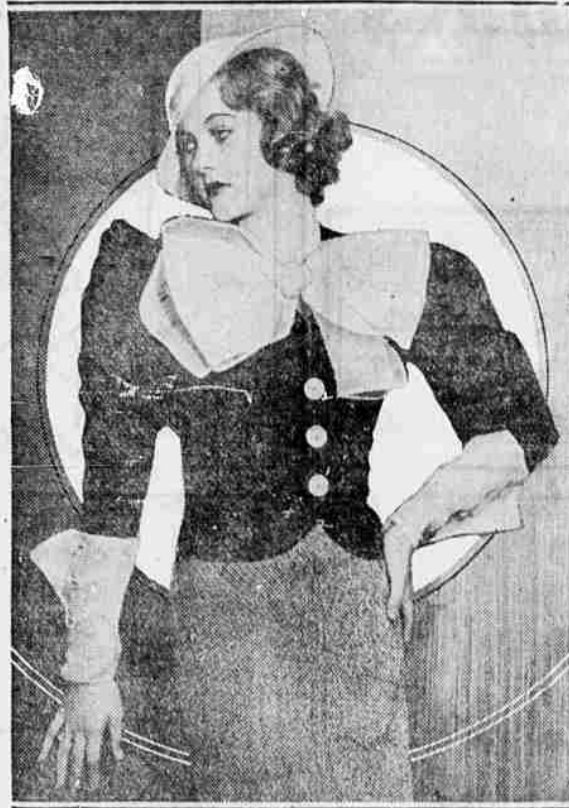
A black satin jacquette with a huge white bow and wide white cuffs distinguishes the smart spring outfit worn by Patricia Ellis, screen actress. The skirt is of gray tweed.