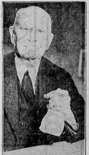
Charles S. Thomas, 84-year-old former United States senator and governor of Colorado, holds a bag containing $120 in gold with which he intends to test the administration order to turn in private holdings of gold to the government.