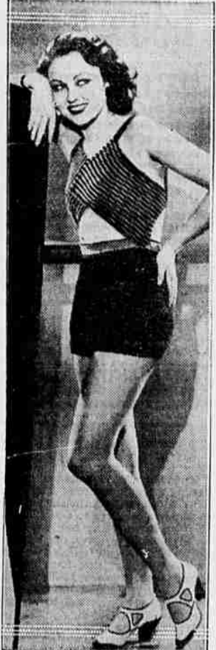
Resort styles have in mind the swimmers who really swim and those who loil the hours away on the sand. For instance, there's the honey-colored, turban-like cap that Jean Parker is wearing. Helen Vincent wears a Turkish toweling costume in red and white with a jaunty cap, and Frances Dee displays a wrap-around skirt with a suit of yellow, navy and green stripes and blue trunks. Navy slacks are included.