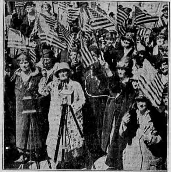
Gold star mothers from 29 states were represented in the first contingent which sailed from New York to visit the graves of their sons on the wartime battlefields of France.

Wash raisins and drain then combine with carrots, celery, relish and seasoning to taste. Soften the gelatin in the cold water and melt over hot water. Blend cottage cheese, mayonnaise and dissolved gelatin, then combine with first mixture. Pour into mold and chill.