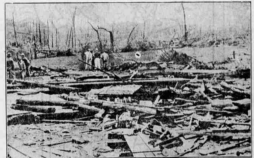
A tornado which cut a path of heavy damage along the Tennessee-Kentucky border, killing more than 50 and injuring scores, took three lives when it struck two houses that stood on this spot near Livingston, Tenn. Two adults and a baby were found dead in this mass of splintered timbers.