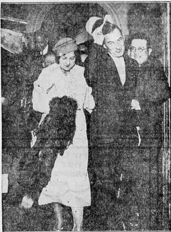
Jimmy Walker, former New York mayor, and his bride, the former Betty Compton, musical comedy actress, are shown leaving the city hall after their unpretentious wedding at Cannes, France.