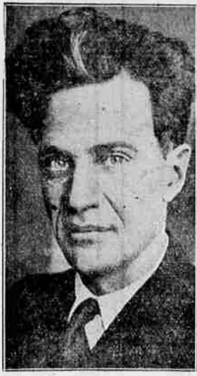
Edgar Ansel Mowrer, Berlin correspondent of The Chicago Daily News, was awarded the Pulitzer prize for the best example of correspondence in 1932.