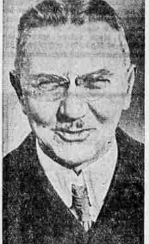
Dr. Hjalmar Schacht, president of the German reichsbank, is shown as he arrived in New York en route to Washington to represent Germany in economic talks with President Roosevelt.