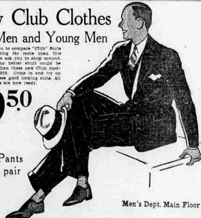
Men's Dept. Main Floor