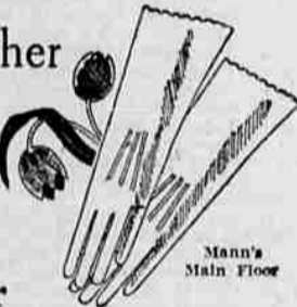
Mann's Main Floor

We can suggest no better gift for Mother than Gloves. Especially these new arrivals in "BACMO" washable cape skin. A lovely white number for summer wear. Also many new styles in beige, gray and cream in fine kid. Plain and novelty cuff and stitchings.