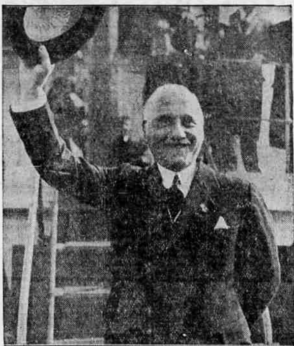
Guido Jung, Italian representative, came to America to confer with President Roosevelt, declaring that Premier Mussolini is ready to "give all the cooperation in his power" in an attempt to attain the economic goals set forth by the President. He is shown as he arrived in New York.

produce, directly to the consumer to the amount of $50 monthly, will be assessed the two per cent sales tax, the legislator's explanation revealed, as the tax applies only to retail merchants. This tax, of which the stores are collectors, eliminates all assessments on tangible and personal property, and will provide funds for relief and the veterans' commission.