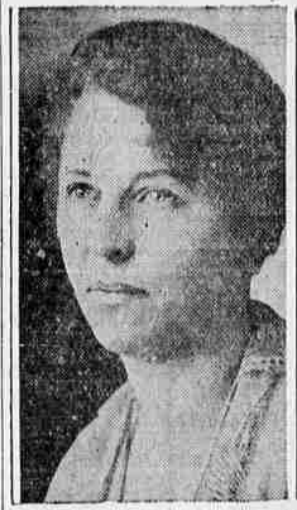
Because of a controversy over her doctrinal views, Mrs. Pearl S. Buck, author, resigned as Presbyterian missionary to China. She expects to return to China soon with her husband, an official of Nanking university.