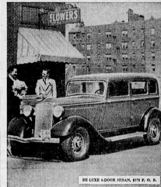
W. W. MAJOR, 2281 W. GRAND AVE., DETROIT, MICHIGAN

STANDARD PLYMOUTH SIX $445 AND UP F. O. B. DETROIT. Floating Power engine mountings. Safety Glass at extra cost. Small down payment... convenient terms.